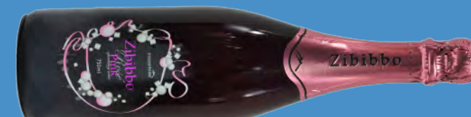
Coldstone Zibibbo NV Rose $188