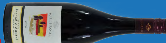
Millbrook Shiraz Viognier 2006 $308 JH 94pts