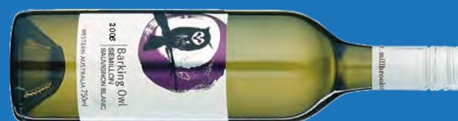
Barking Owl Semillon Sauvignon Blanc 2008 $165