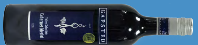
Valley Selection 2007 Cabernet Merlot $165