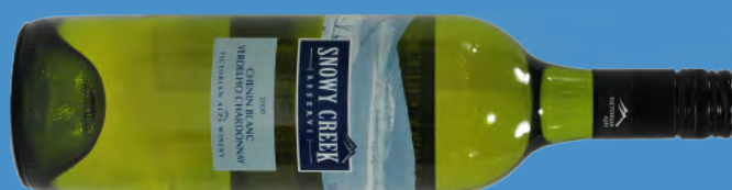
Gapsted Snowy Creek Chenin Verdelho Chardonnay 2009 $85