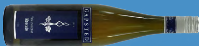
Valley Selection Moscato 2011 $140