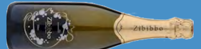
Coldstone White Zibibbo NV $188