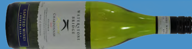
Waterstone Bridge Chardonnay 2009 $128