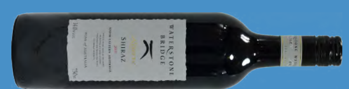
Waterstone Bridge Shiraz 2009 $128